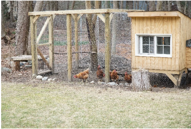
Figure 1. A small chicken coop with attached run

When you are thinking of where to put your chicken house, consider disease control and biosecurity. 'Bio' means life and 'security' is protection. A biosecurity plan for a poultry facility is a series of common-sense activities designed to keep disease out of your flock. It is good to fence off the area where you keep your chickens. Only let people who care for the chickens come into contact with them. It is also a good idea to keep your chickens confined to protect them from predators (see Figure 1). It is highly recommended you 'predator-proof' your facility. For the run, secure wire that is buried at least 24 inches to prevent digging by ground predators. If you cannot bury the wire, then bend it outwards at least 24 inches from the edge of the coop and make sure it is flush with the ground. It is good to walk the perimeter of the facility daily to check for signs that a predator has been trying to enter your coop.