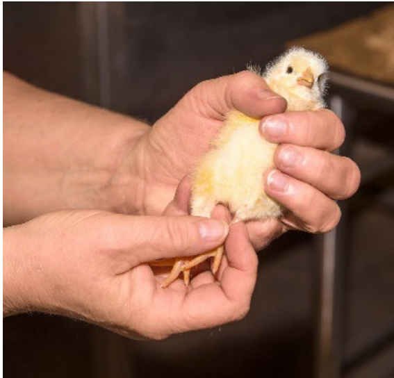
Figure 11. Examining the abdominal area of the chick

Before taking your chicks home, examine them to confirm that they have well-healed navels (Figure 11). Just before the chick hatches, they take what is left of the yolk material in the egg into their abdomen. It is important that this seals completely so that it does not become infected.