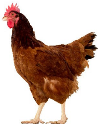
Figure 15. Rhode Island Red hen