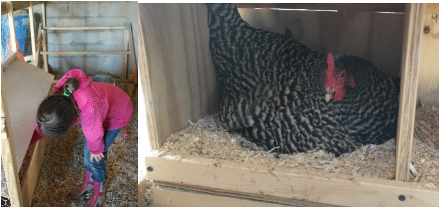
Figure 4. Example of nest boxes

When the pullets get older and closer to laying eggs, you will need to provide them with nest boxes such as the ones in Figure 4. The boxes should be 1-foot x 1-foot x 1-foot. You should provide at least 4 nest boxes for your flock. The nest boxes shown are good because they have a slanted roof, preventing the chickens from sitting there and messing up the top. They could be better but having a perch in front of the nest boxes so that the hens do not have to jump directly in the box. They can jump onto the perch and walk into the box. This reduces the likelihood that they will break the eggs getting in and out of the nest boxes.