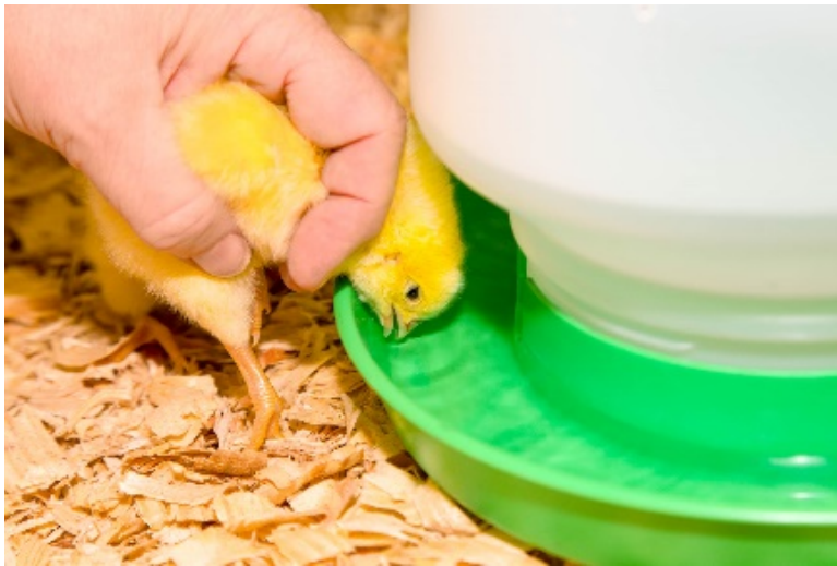
Figure 13. Teaching a chick to drink from an open-source waterer.

When you first place the chicks in the brooding area it is important that they learn to drink. Dehydration is the most common cause of death in young chicks. When using an open-source waterer, the best way to teach the chicks to drink is to dip their beaks in the water (Figure 13). If using nipple drinkers, touch the beaks to the nipples (Figure 14). You should teach every chick where the water is.