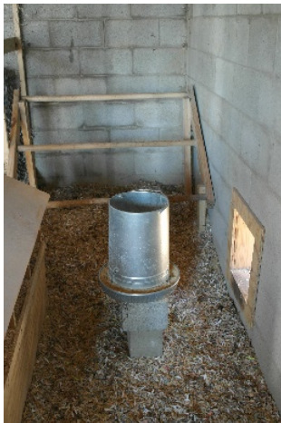
Figure 2. Example of a shelter as part of an existing facility with added outdoor access, nest boxes and perches

There are many options for housing design. The housing could be part of an existing facility, with outdoor access attached to it (Figure 2), or a stand-alone poultry house like Figures 1, and 3.