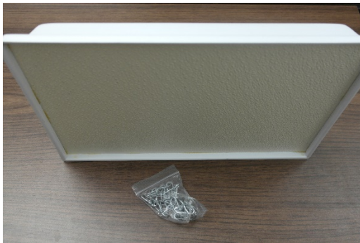
Figure 10. Sweeter heat showing the underside and the chain the comes with it to hang the heater.