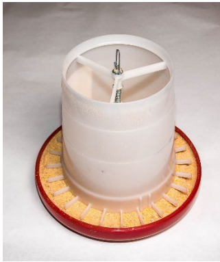
Figure 7. Example of tube feeder that can be used for any age of chickens.