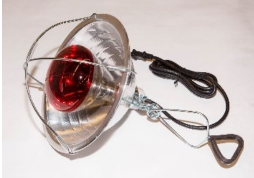
Figure 9. A heat lamp.

The most commonly used heat source is a heat lamp like the one in Figure 9. If using a heat lamp, make sure that you use a porcelain socket and hang the lamp from a chain so that it does not fall into the litter and start a fire. You adjust the heat by raising or lowering the heat lamp. There is a new heat source available on the market that you can use as well. It is called a 'sweeter heater' (Figure 10) and it is less of a fire hazard.