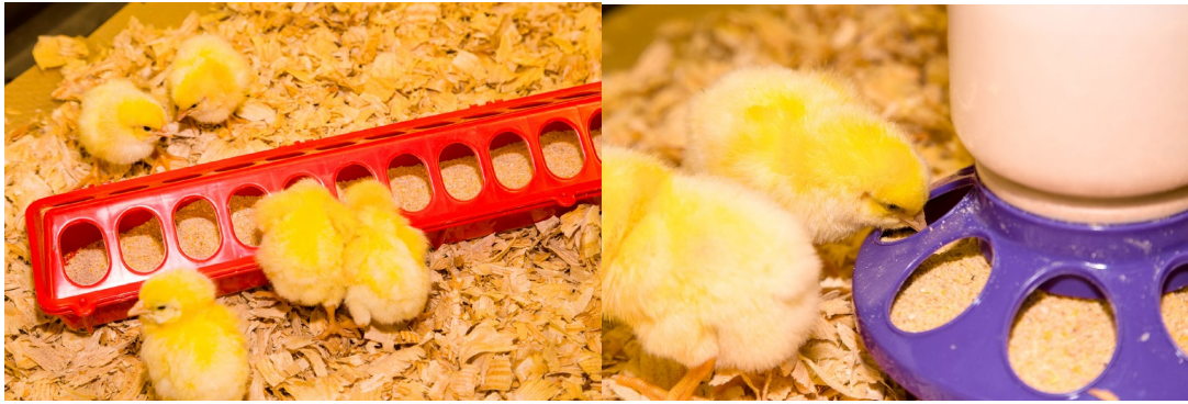
Figure 6. Two examples of chick feeders.