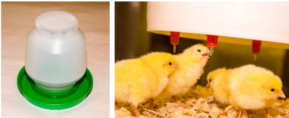
Figure 8. Two types of waterers that can be used for both chicks and older chickens.

Chickens won't eat if they can't drink. Chickens will typically drink twice as much water as feed. So, if they eat 1 pound of feed, they will drink about 2 pounds of water (1 quart). It is important to provide fresh, clean water every day. You have a couple of options as shown in Figure 8. Both types of waterers can be used from chicks to adult, you just need to adjust the height of the waterers as the chicks get bigger. The open waterers tend to get full of shavings and feed, and it is easy to spill the water making the bedding wet. The nipple drinkers are an excellent way to make sure that they have clean water, with less mess, but it is essential that you regularly verify that the nipples are working.