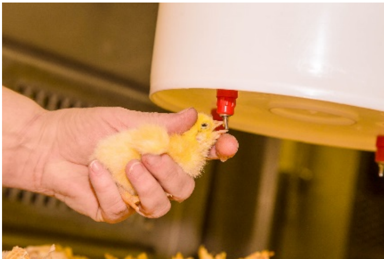
Figure 14. Teaching a chick to drink from a nipple drinker.

It is important that the chicks start eating as well. Make sure the chicks always have fresh feed in front of them. At the same time, however, you don't want them wasting feed. For the first day or two you can place the feed in egg cartons until they become accustomed to chick feeders. After that, always put the feed in a feeder. Do not throw the feed on the ground for the chicks to pick up.