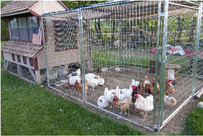
Figure 3. An example of a stand-alone poultry house with outdoor run.