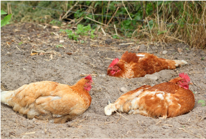
Figure 5. Adult chickens dustbathing.