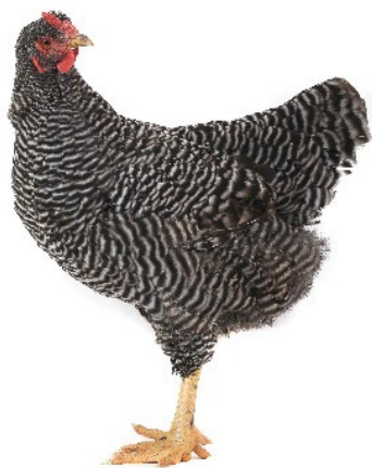
Figure 14. Barred Plymouth Rock hen

The Plymouth Rock is an American breed of chicken that was developed in Plymouth, Massachusetts in the late 1900s. The breed quickly rose in popularity in the United States because of its egg-laying capabilities while still being a good meat chicken. This makes it a great dual-purpose breed. It is kept for both meat and for its large brown-shelled eggs. Properly managed, the hens can produce about 200 eggs per year.